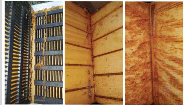
Images of hive interiors, from left to right: stapled propolis traps, parallel grooves, and roughened walls (Hodges et al. 2020)