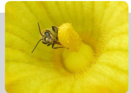
Wild squash bee on a pumpkin flower.