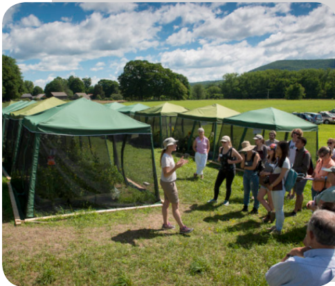
Lynn Adler leading a tour of the research tents.

In order to support bee health, advocacy groups have encouraged planting flowering strips along agricultural fields, roads, and residential areas. In addition to providing food, however, these flowers can be hubs of disease transmission for pollinators. Recently, researchers from Lynn Adler's UMass lab tested the impact of different flowers on bumble bee health. They had previously shown that certain flowers increase or decrease transmission of bumble bee gut infections in the lab (read it here ). In this study, they assembled three groups of outdoor tents and filled them with: (1) a pollinator-dependent crop (canola) + a flowering strip of mostly high-transmission plants, (2) canola + a low-transmission flowering strip, and (3) canola only. They placed bumble bee microcolonies in the tents for 2-week intervals and monitored bee disease and colony reproduction. They found that bees in tents with high-transmission flowering strips had double the infection intensity of those in low-transmission tents. However, bumble bee reproduction was improved in tents with any flowering strip, compared to those with only canola.