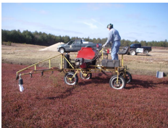
Gephardt drop spreader delivering granular herbicide to the cranberry farm surface. Note white droplet of foam at left, which helps to guide the driver.

Preemergence herbicides (except Devrinol) should not be applied to new plantings for at least the first 12 months or until the vines are established. Norosac/Casoron should not be used until the vines are well established (usually the third year). Consider using postemergence herbicides and hand-pulling for control of invading grasses and perennial weeds.