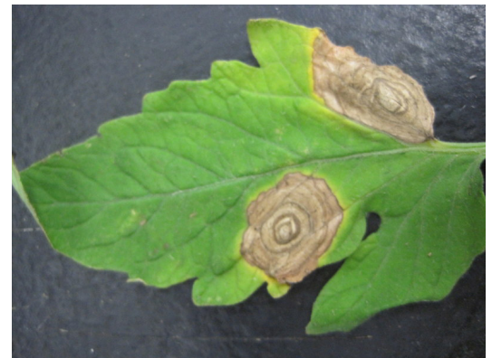
Botrytis cinerea on tomato.