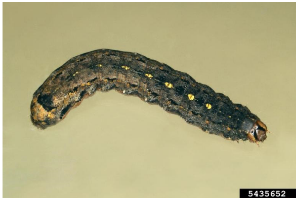
Above: Variegated cutworm