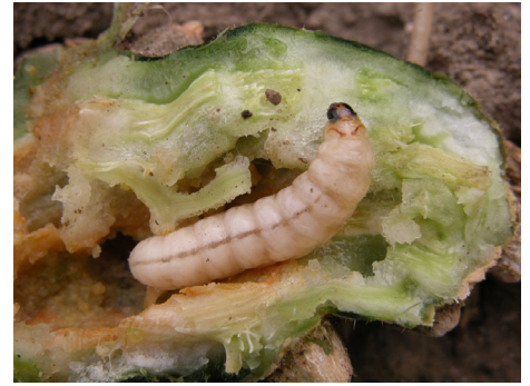
Squash Vine Borer larva.

Colorado potato beetle adults, eggs, small and large larvae are all present now in untreated and/or uncovered crops. Spray thresholds for potato are: 0.5 adults, 4 small larvae, or 1.5 large larvae per stalk (if plants are smaller than 18" tall) or per plant (if plants are larger than 18" tall). For eggplant: 2 small or 1 large larvae for plants less than 6" tall, and 4 small or 2 large larvae for plants more than 6" tall. Labeled conventional materials include pyrethroids, neonicotinoids, novaluron (e.g. Rimon), cyromazine (e.g. Trigard), spinosyns (e.g. Radiant), and diamides (e.g. Verimark, Exirel). In recent years, we have observed resistance to both neonicotinoids and syn-