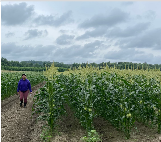
Corn is silking at Mountain View Farm in Easthampton.

Thrips feeding also creates wounds that allow for entry of bacterial pathogens, which can cause bacterial bulb rots (when one or more individual layers of the bulb become watery and rotten) in storage. If controlling with pesticides, treatment is warranted when populations reach 1-3 thrips/leaf. Growers using organic pesticides should use the lower 1 thrip/leaf threshold. Use an adjuvant with all materials to help materials adhere to waxy allium leaves, unless it says otherwise on the label.