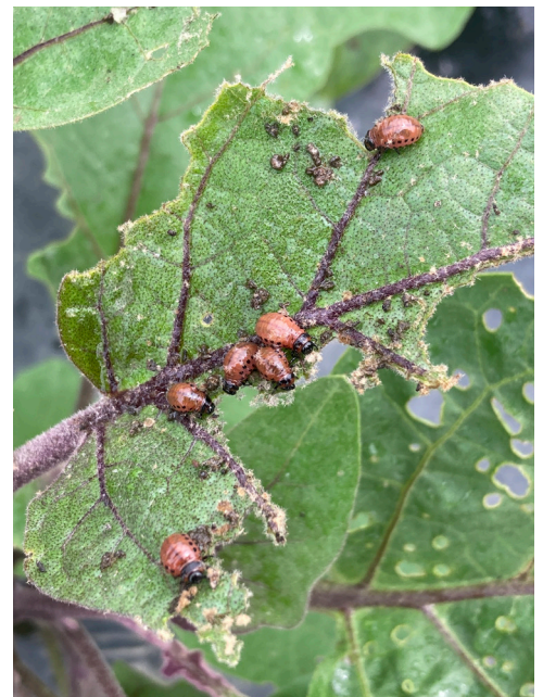
Colorado potato beetle small larvae.