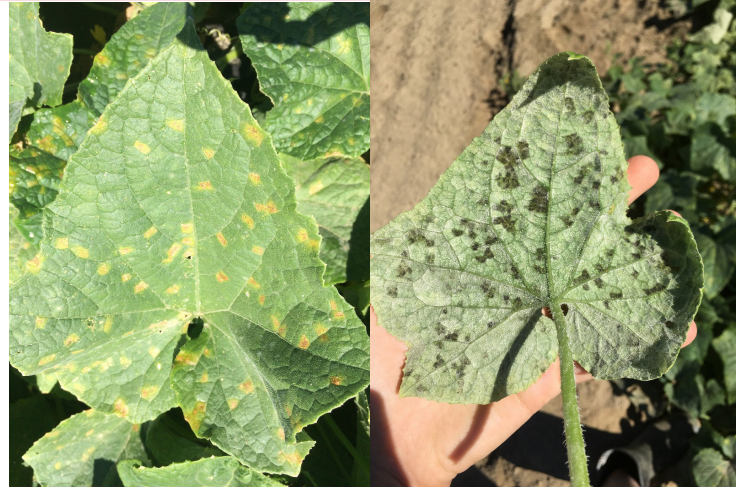
Cucurbit downy mildew on the top (left) and bottom (right) of a leaf.

Squash vine borer trap counts have shot up in some locations this week. SVB adults lay eggs at the base of thick-stemmed cucurbit plants (e.g. summer squash, zucchini, some winter squash), and the larvae tunnel inside the stem, causing the plant to wilt and often die. This pest can be monitored using phero-