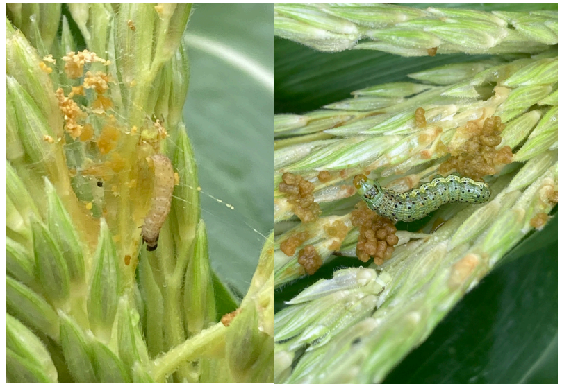
European corn borer larva (left). Corn earworm larva (right).

European corn borer: untreated tasseling corn was above the 15% infestation threshold Hampshire Co. this week. When scouting, look for shot-hole type feeding (small round holes) and frass in foliage and tassels.