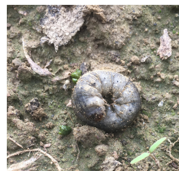
A black cutworm curled into a characteristic “C” shape after being dug up.

Black cutworm larvae are dark gray and appear “greasy”, though this appearance is actually caused by the granular