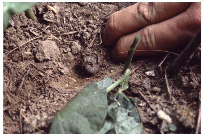
Cutworm damage in bean, and a cutworm discovered nearby.

Cutworms are generalists and will feed on most vegetable crops. Young larvae of both species (1 st , 2 nd , and 3 rd instars) and large variegated cutworm larvae feed on crop foliage; larger black cutworm larvae will more often cut plants at the base to feed, sometimes pulling the entire plant underground. Plants will usually grow out of the foliar feeding damage from small larvae but larger larvae can defoliate plants, and stem cutting from heavy infestations can cause significant crop loss. Plants also usually grow out of their susceptibility to damage. Variegated cutworm will also feed on tomato fruit, creating holes that can become quite deep. Cutworms may feed on crop roots but generally do not cause significant root damage. This year we’ve gotten reports of cutworm damage in beans, peas, peppers, and artichoke, and we routinely see damage in brassica transplants also.