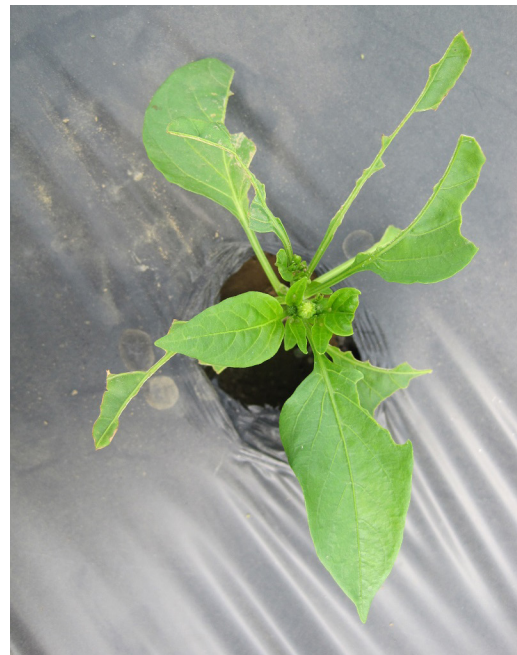
Cutworm damage on pepper.

In small areas, hand squishing can be effective. During the day, cutworms are often just below the soil surface at the