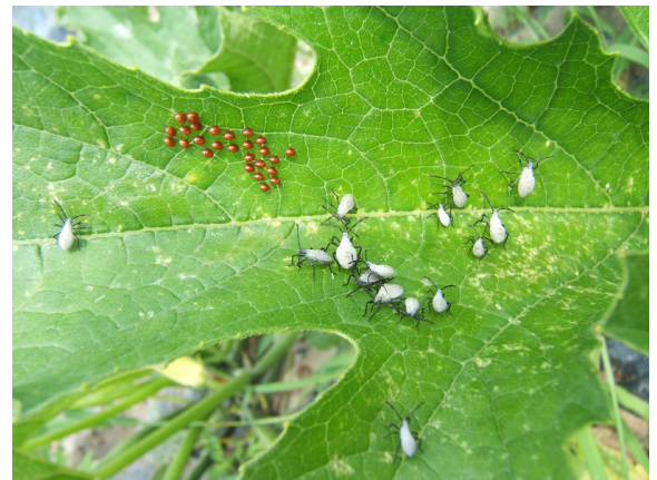
Squash bug nymphs and eggs