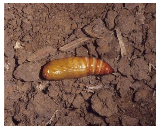
Black cutworm pupa.

Black and variegated cutworms generally do not overwinter in locations where topsoil freezes, but they may overwinter in the Northeast in high tunnels. (We’ve seen lots of cutworm damage in winter high tunnel greens over the last several years—this damage could also be caused by winter cutworm, a different, more cold-tolerant species.) Both species overwinter in the South and Mid-Atlantic and adults are blown northward on storm fronts in the spring. Black cutworm moths arrive in the Northeast between March and June, and variegated cutworm moths arrive slightly later, in mid-/late summer. Moths lay eggs on plants, preferring low lying areas or areas that frequently flood and fields with lots of crop residue.