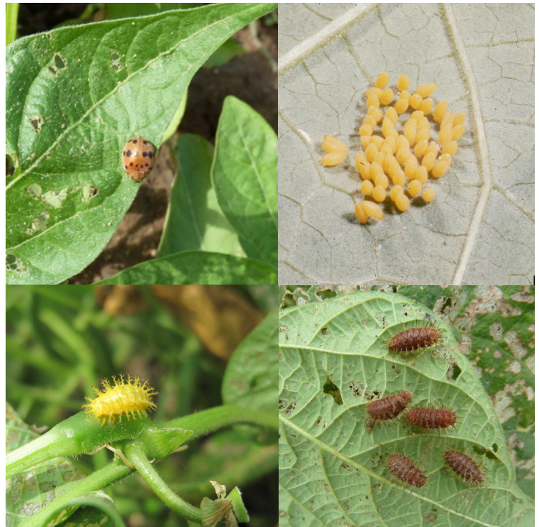
Clockwise from top left: Mexican bean beetle adult (UMass Vegetable Program), egg mass (J. Baker, North Carolina State Univ., Bugwood.net), larva (UMass Veg Program), and mummies (larvae that have been parasitized by the Pediobius wasp (UMass Veg Program).

Pediobius is also available from the following suppliers: