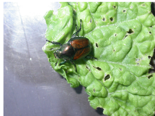
Japanese beetle adult

White mold —a disease with a wide host range including veg crops like beans, cabbage tomatoes, and potatoes—was confirmed in lettuce in Hampshire Co. this week, and we’ve heard other reports of WM from around the region on multiple crops including high tunnel cucumbers and beans. White mold is caused by the fungus Sclerotinia sclerotiorum , which produces fluffy, white mycelium on infected plants and sclerotia (masses of fungal tissue surrounded by a hard, dark rind that act as survival structures) that look like mouse droppings within infected tissue. Sclerotia can survive in the soil for many years. In the spring, sclerotia germinate and produce fruiting bodies that in turn produce spores. The spores infect senescing flowers or leaves and move into healthy tissue from there. If you have a limited infestation, removing plants from the field or tunnel can limit soil contamination. Contans is a biogungicide labeled specifically for white mold control, attacking the sclerotia. It is best applied at the end of the season so that it has all winter to find and destroy sclerotia in the soil. Priaxor Xenium, Luna Sensation, and Cabrio are labelled for disease suppression only.