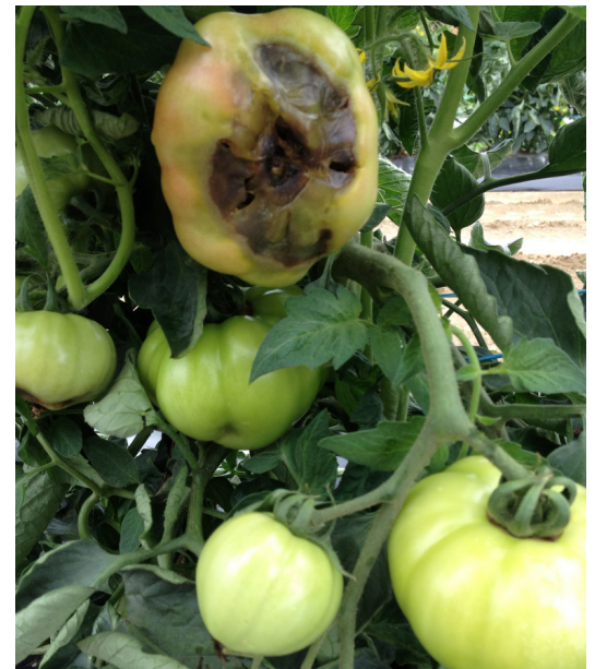
Blossom end rot.

Many growers focus on calcium (Ca) at this stage in order to avoid blossom end rot (BER) later in the season. However, BER is more an imbalance of Ca within tomato plants themselves rather than lack of Ca availability, and more often than not, it is related to soil moisture fluctuation, heat stress, and sometimes, excessive nitrogen rather than a deficiency of calcium in the soil. Potassium (K) deficiency, in concert with excessive heat, can be an even greater problem for quality fruit production than Ca, resulting in blotchy ripening, yellow shoulders, and grey wall. Indeterminate varieties in tunnels and greenhouses continuously carry heavy loads of fruit, so potassium demand remains high from early summer onward. (See “Abiotic Disorders of Tomato” in the June 15, 2023 Issue of Vegetable Notes for more on these and other physiological disorders.)