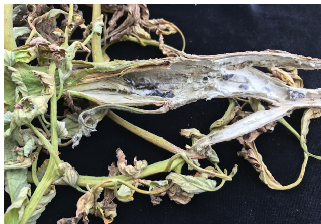
White mold.